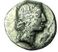
Coin of Metellus Pius from Spain